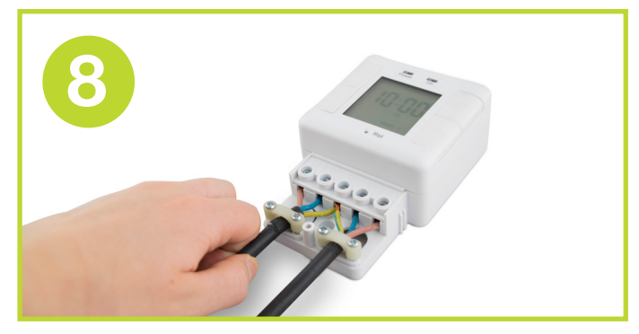
Test that the wires are fixed in properly by pulling on the cable. If a wire comes loose, repeat from step 6.