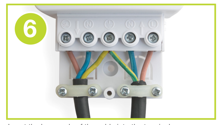
Insert the bare ends of the cable into the terminals as per the wiring instructions.