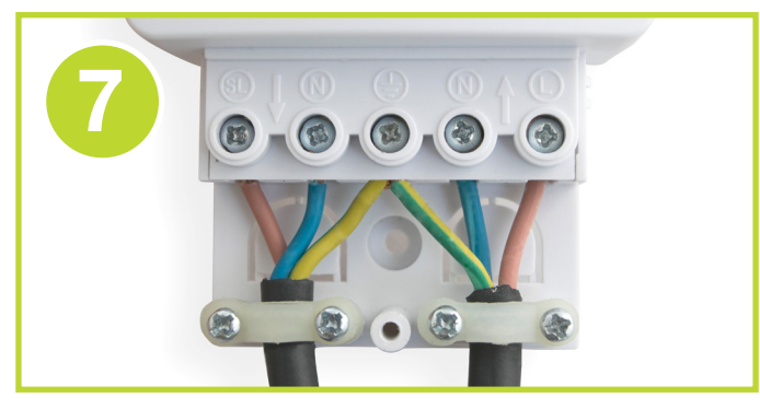
Fully tighten the terminal screws and make sure that no bare copper is exposed outside of the terminal.