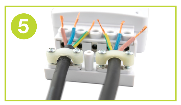
Use the cable clamps to secure the cable into position.