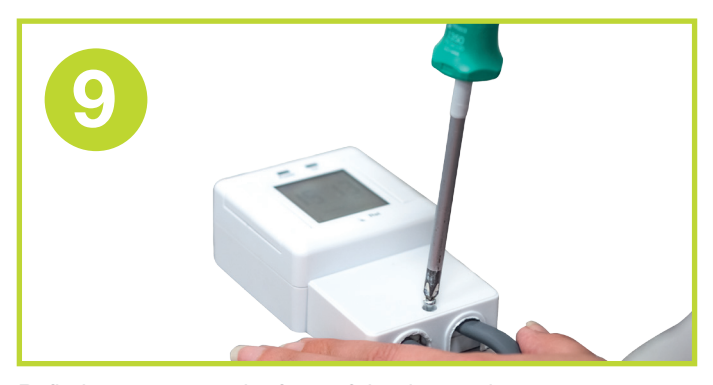
Refit the cover onto the front of the timer unit.