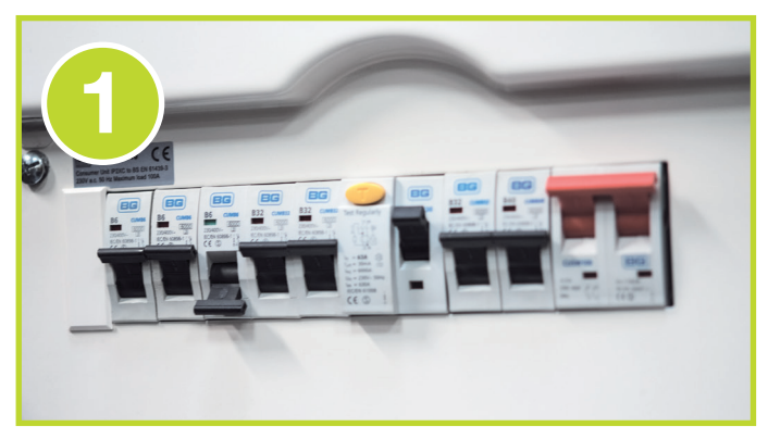
Before starting any electrical work, make sure that the mains supply is turned off at the consumer unit.