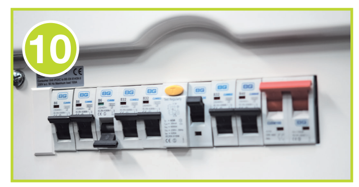
Restore the power to the circuit at the consumer unit and test.