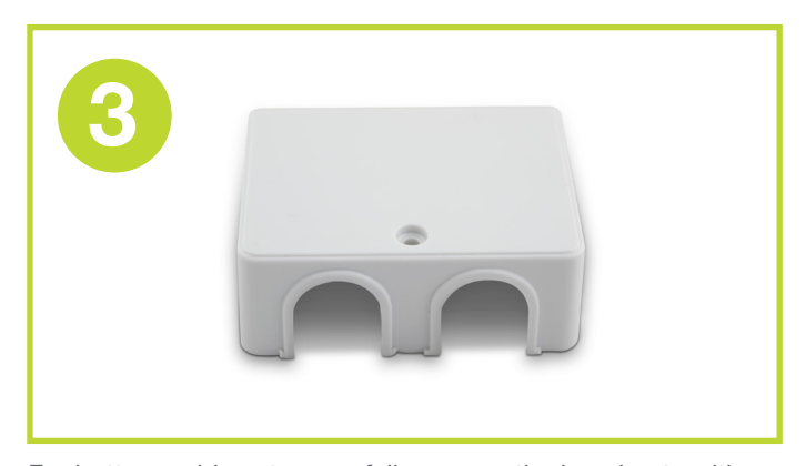
For bottom cable entry, carefully remove the knockouts with a suitable tool, ensuring the edges are smooth.