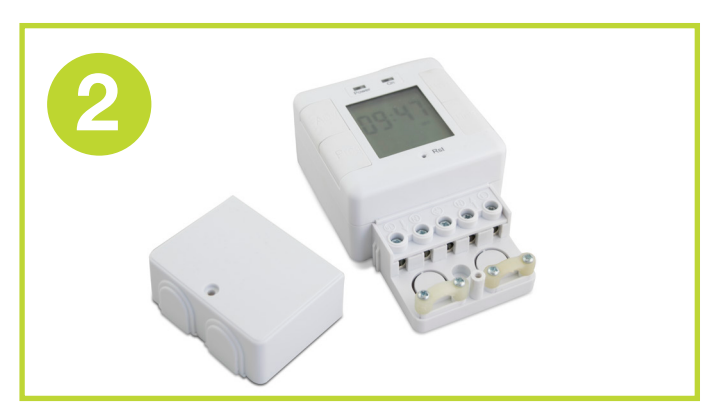
Unscrew the fixing screw to remove the cover at the bottom of the timer, exposing the terminals.